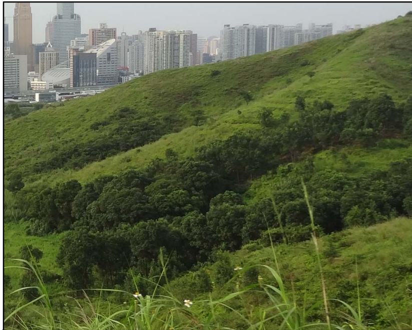
LR1.1 Hillside Woodland Distribute at Valley