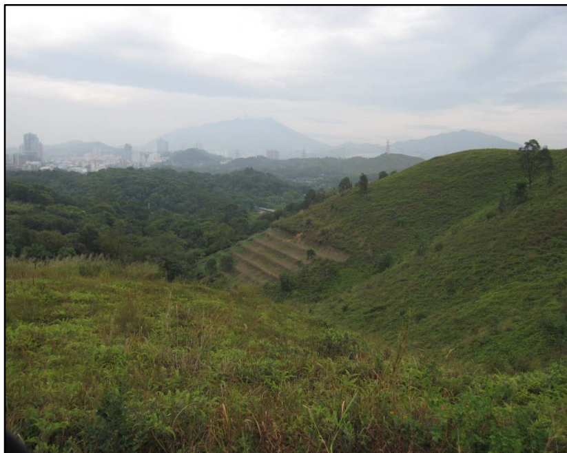
LR2.1 Uphill Shrubby Grassland