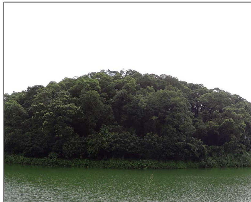
LR1.3 Exposed Uphill Woodland