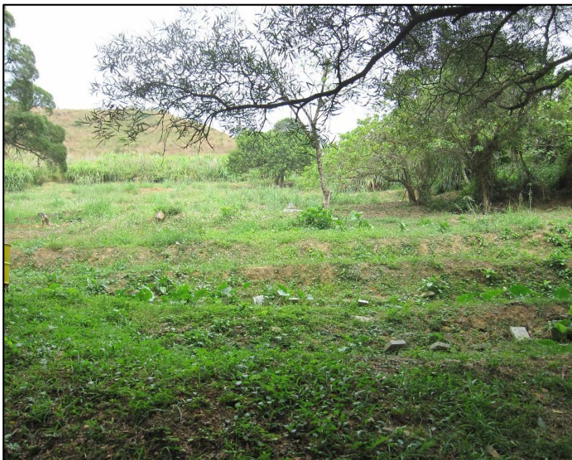
LR2.2 Foothill and Middle hill Shrubby Grassland