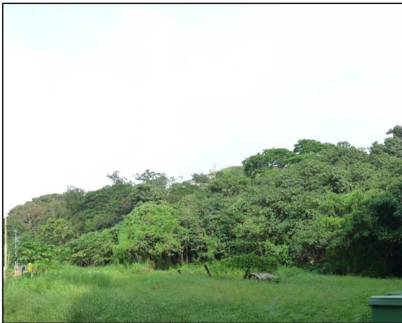
LR1.2 Hillside Woodland Distribute along the Toe of Upland